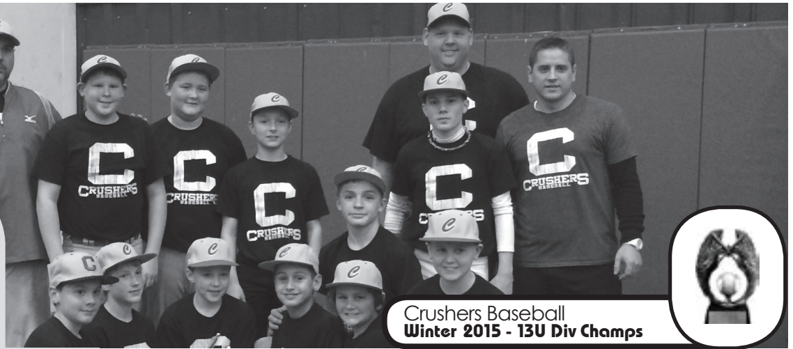
Crushers Baseball Winter 2015 - 13U Div Champs